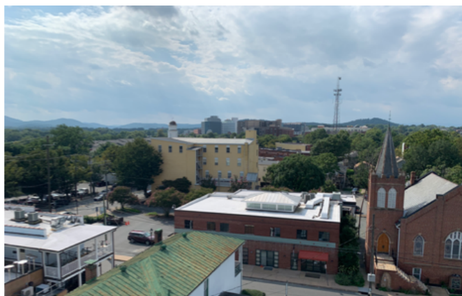
The Equity Center's new home is the fourth floor of the Hotel Albemarle Building on W. Main St., the yellow building in the center.